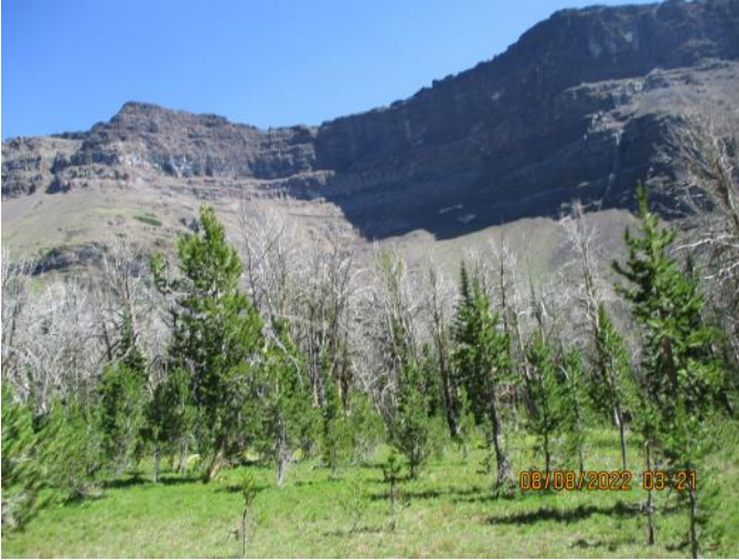
Kitty Creek below left